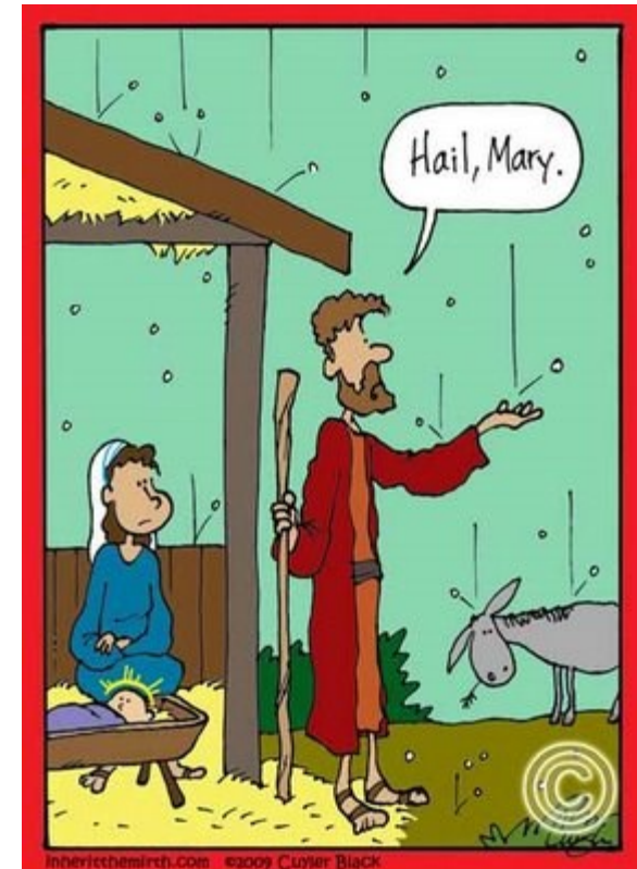
A throwback to the ‘Lighter Side’.